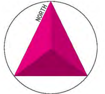
AS PROPOSED: FIRST + SECOND FLOOR PLAN